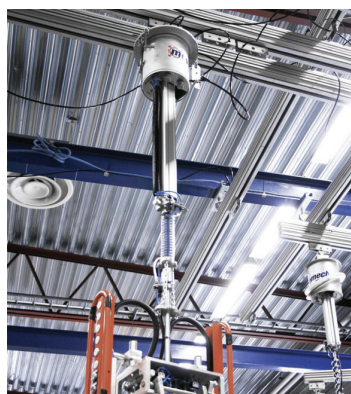
Free rotation offers great advantages in complex assembly operations.

For more information, contact your sales representative.