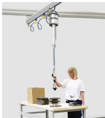
Mechlight Pro facilitates repetitive lifting.

* Air preparation unit (FRL) is included