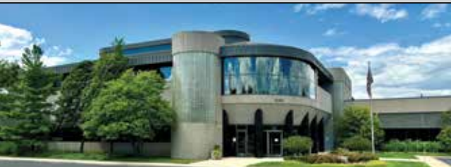
Our Global Headquarters in Waukegan, Illinois, U.S.A.

We cordially invite you to visit our modern manufacturing facilities in Waukegan, Illinois, USA; Mainz, Germany; Monteveglio, Italy; Dalian, China; and Diadema, Brazil.