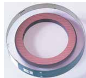
Micro-lapped DEUBLIN seal

For positive sealing, smooth rotation, and long service life, all DEUBLIN seals are micro-lapped with proprietary machines and compounds to achieve an optical flatness of 2 light bands (23 millionths of an inch, or 0.58 microns). In addition, all DEUBLIN coolant unions use seals made from special grades of silicon carbide for superior resistance to wear and heat accumulation.