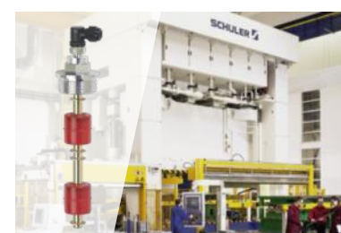
Machinery & Plant Engineering