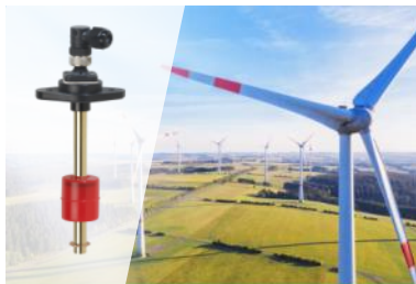
Wind power plant