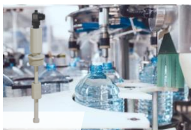
Dosing & Filling Technology