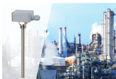
Tunnel Boring Heavy Industry