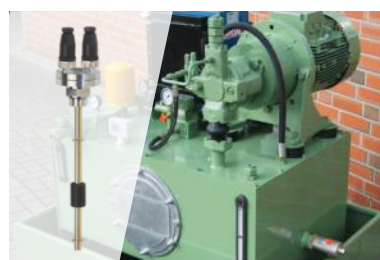
Hydraulic Power Units