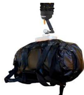
TAWI High Frequency Lifter

Lift a great variety of goods of different shape, size and weight.